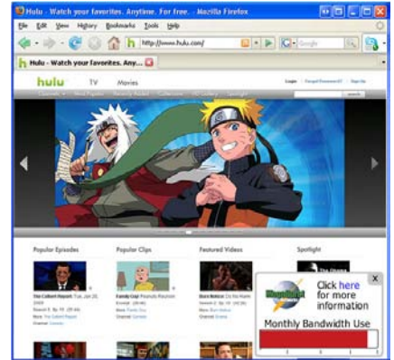
Bandwidth Usage Notice

Bandwidth usage notices provide the subscriber with an on-line real-time measure of their current bandwidth usage. If necessary, the subscriber can manage their remaining bandwidth and avoid overage charges.