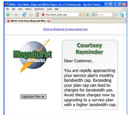
Bandwidth Up-sell Notification

As a subscriber approaches their usage cap, the notification format may be swapped to display a message as a courtesy reminder that includes an up-sell opportunity promoting a more robust service tier with increased bandwidth.